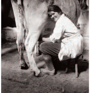
Land Girl milking.

Left: A 'Law-Abiding Suffragists' rally in Hyde Park.